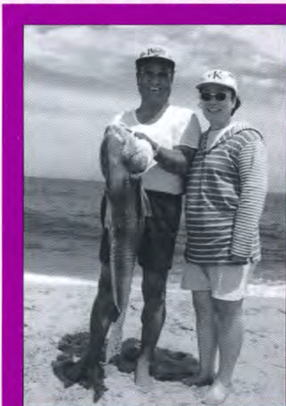
True Parents caught a 20 lb. Golbinegro Punta del Este in Uruguay.