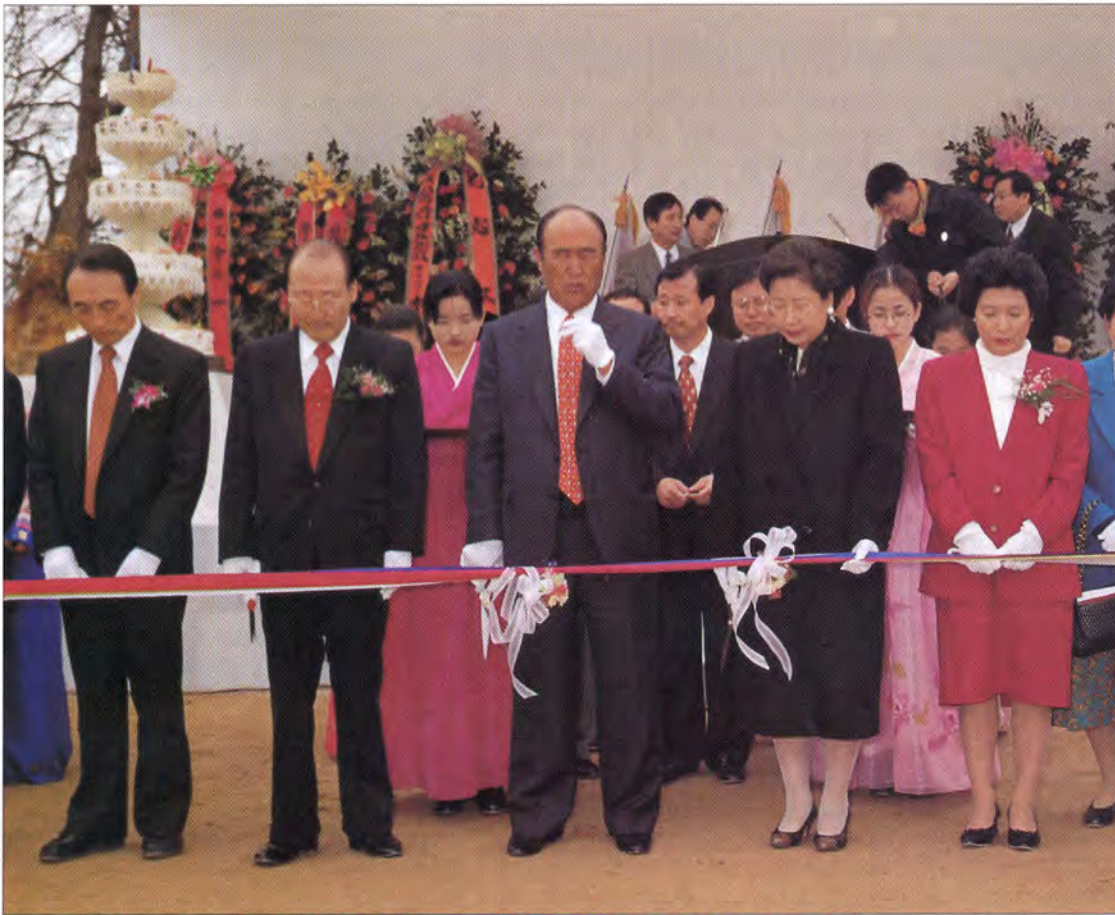
True Parents pray before cutting the ribbon to inaugurate the new Chung Pyung Lake Training Center. March 10, 1997.

ating, they will become agents of God's punishment, or, let us say, a wake-up call to us. This is a reality we were told at Chung Pyung Lake.