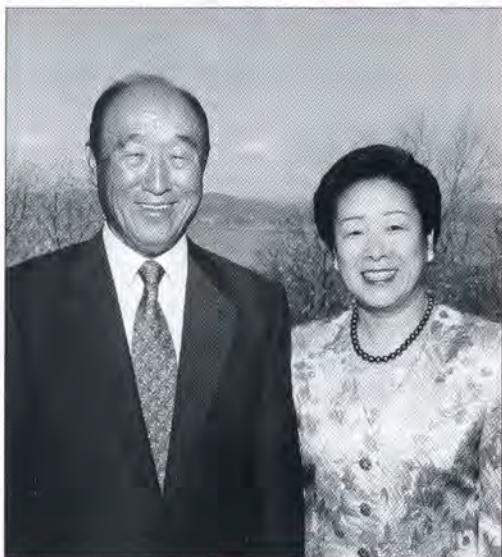
Front Cover: True Parents pose for a photo on the occasion of their Holy Wedding Anniversary, April 22, 1997. East Garden, New York.

Ground Breaking at Sun Moon University & at Chung Pyung 14 True Parents' Day Congratulatory Evening Performance 15