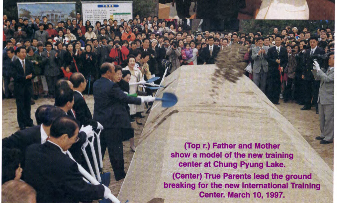
(Top r.) Father and Mother show a model of the new training center at Chung Pyung Lake.