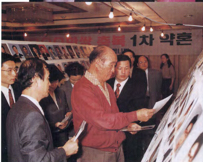
Father matches 500 couples in Seoul, Korea. April 3, 1997.