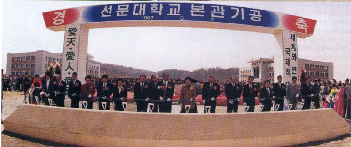
Ground breaking for the new main building of Sun Moon University. March 11, 1997.