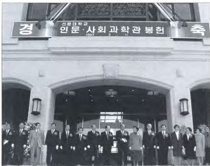
True Parents and Korean leaders in front of the main entrance at Sun Moon University. March 11, 1997.