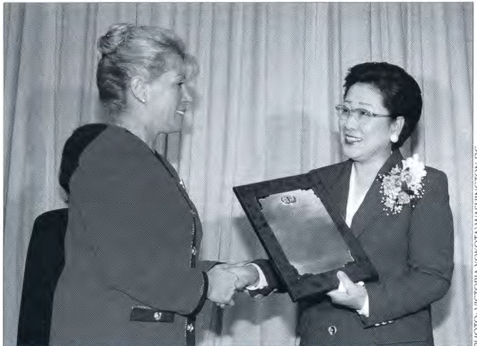
Mother receives a plaque from a member of the Women's Federation for World Peace in Uruguay.