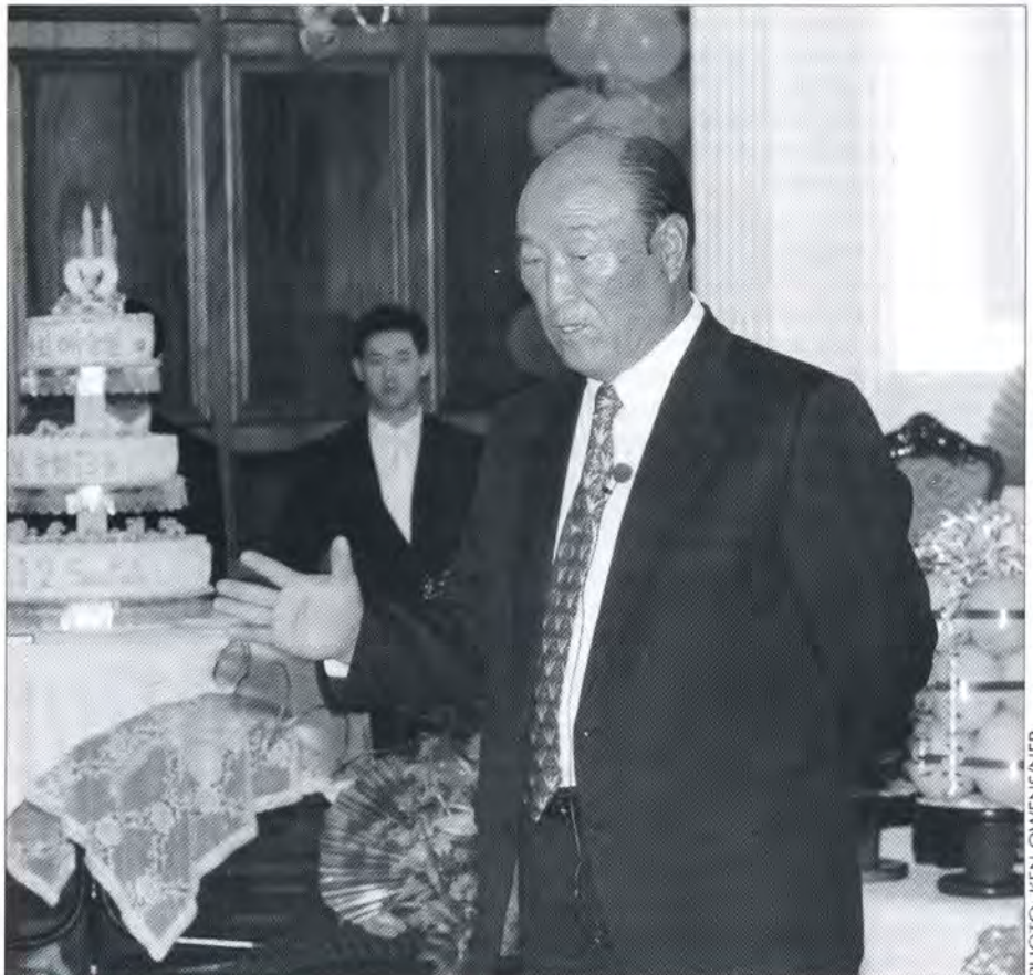
Father: "The holy blessing ceremony is the way to overcome everything and go beyond nation, race, culture, religion and tradition."

Adam's family bore Satan's blood lineage. After the restoration of blood lineage, centering on mind and body, Jesus had to indemnify all the historical and providential contents from the past through his present time. He engaged in a serious fight to understand these providential contents. Even though God knows the contents of indemnity, He cannot reveal them. Satan also knows the contents of indemnity, but Satan cannot teach them. God could not say that the problem was the fallen blood lineage, which has to be cut off because the fall took place in the realm of incompleteness centered on illicit love. The same is true with Satan.